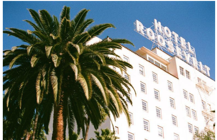
The Hollywood Roosevelt Hotel.